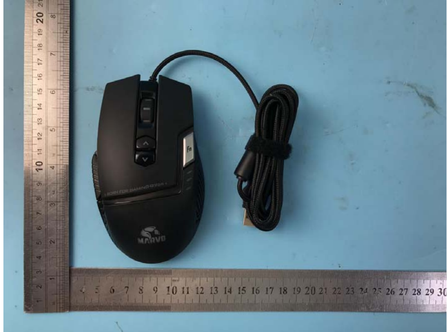
Photograph of Sample

DTI authenticate the photo on original report only